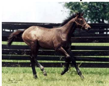
Monarchos in 1998, practicing to win the 2001 Kentucky Derby in the 2nd-fastest time ever.

DARBY DAN (859) 254-0424 www.darbydan.com