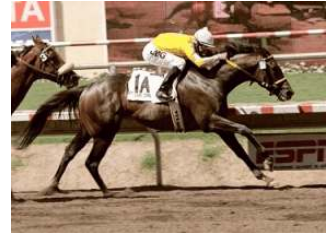
Came Home at Del Mar