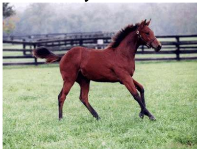
His full sister sells at Keeneland November as Hip #87 . Where will the similarities end?