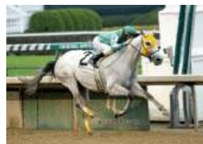
Four Footed Fotos

UNPETEABLE TAKES THE GRAY GHOST-- Churchill's all-gray Halloween Day feature. :-0