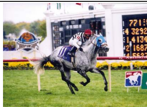
STARINE (Hip 407) winning the Breeders' Cup Filly & Mare Turf S.-G1 Oct. 26. Her dam, GRISONNANTE , sells as Hip 572 Tuesday at Keeneland.