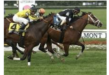
I'm All Yours

A winner in three of his four previous tries at Aqueduct, I'm All Yours (Belong to Me) will try to take his batting average at the Big A to .800 in today's GII Knickerbocker H. The late-running New York-bred has won two of his six starts this season, capturing an open allowance test at Saratoga in July and the Ashley T. Cole H. against fellow state-breds at Belmont Sept. 21. The five-year-old gelding's biggest concern will be the condition of the turf. Last time out, on