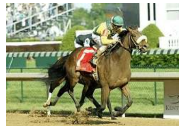
Farda Amiga