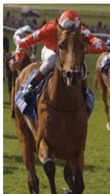
Rock of Gibraltar