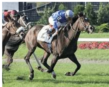
Kazzia Wins at Belmont Park

Dual Classic winner Kazzia (Ger) (Zinaad {GB}--Khoruna {Ger}, by Lagunas {GB}) has been retired, Godolphin announced yesterday. A perfect two-for-two