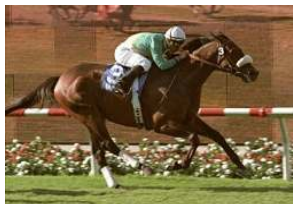
Sarafan winning at Del Mar

With Tokyo Racecourse undergoing repairs this year, the 21st running of the G1 Japan Cup is set for this Sunday at Nakayama Racecourse and has drawn an internationally flavored field of 16 for the 1 3/8-mile event. Japanese-based horses have been successful in each of the last four runnings of the $4 million test and the home defense is headed this time around by Symboli Kris S. (Kris S.). Unraced as a juvenile, the Kentucky-bred colt has been outstanding this season, with four victories in five tries, including a 3/4-length success in the G1 Tenno Sho at Nakayama Oct. 27.