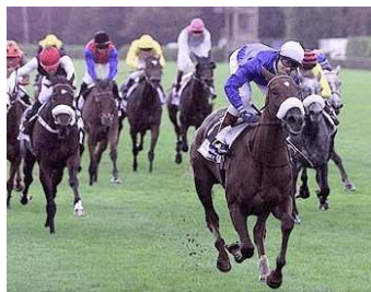
Bright Sky defeats Irresistible Jewel

start is Golan (Ire) (Spectrum {Ire}), who has only run three times since finishing sixth in last year's renewal. After winning the King George to start the year, he was a close second in the G1 Juddmonte International and most recently ran sixth in the G1 Breeders' Cup Turf Oct. 26. "He likes an uphill finish and will act on this track--it's