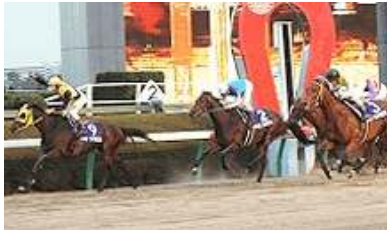
Eagle Café Takes Japan Cup Dirt

Eagle Café (Gulch) was sent off at 19-1, but shot through a gap at the top of the stretch and held off 123-1 outsider Regent Bluff (Jpn) (Park Regent) to win the G1 Japan Cup Dirt by a length at Nakayama yesterday afternoon. "He was in great form," winning jockey Frankie Dettori said. "I just put the horse in the right position and he did everything." The five-year-old ended a 26-month drought with a win in the