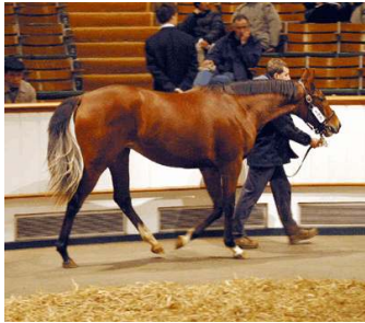
Topper Lot 192