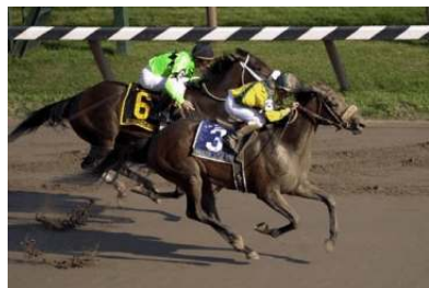
Allamerican Bertie (inside) just misses at the Spa