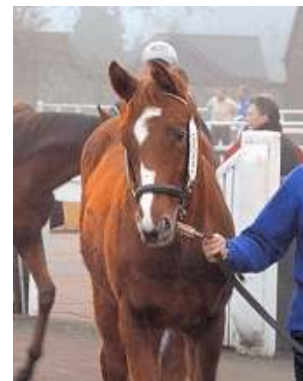
Giant's Causeway filly

Saturday, Aqueduct, post time: 3:38 p.m. EST