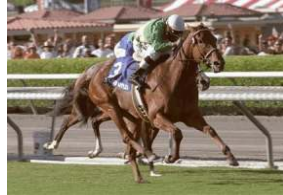
Golden Apples