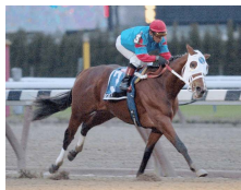
Toccet A Coglianesse

All carry 123 pounds, except Dress to Thrill, 120.