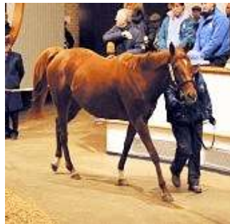
Tatts topper Lot 1481

Unraced Molasses (Fr) (Machiavellian) brought a 625,000gns final bid yesterday to kick off the breeding stock portion of Tattersalls' December Sale. The four-year-old, who is in foal to Mozart (Ire), was offered