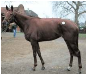
Midnight Angel