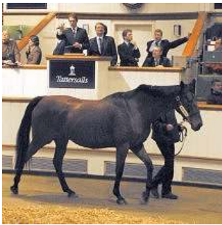
Velvet Moon tops at Tatts