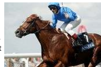
Grandera at Royal Ascot