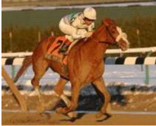
Snake Mountain

Winless in three starts overseas, Snake Mountain (A.P. Indy) won for the sixth time in 10 tries in the U.S., taking yesterday's GIII Queens County H. at Aqueduct. Fourth in the GII Saratoga Breeders' Cup H. Aug. 17, the gelding bounced back with a 2 1/2-length allowance tally at Belmont Oct. 4 and was coming into this off a half-length score in the GIII Stuyvesant H. on Election Day. Perfectly placed in fourth down the backstretch, the chestnut angled out four wide for the drive and held sway to defeat Docent (Waquoit). "We had to go a little wide today, but it doesn't matter. This horse keeps dig-