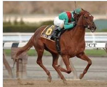
Top Juvenile Added Edge