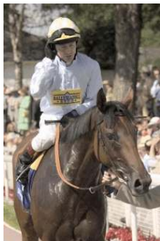
Islington