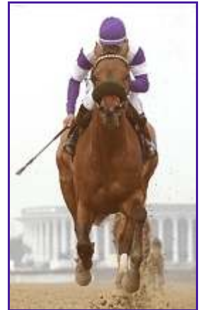
Elloluv