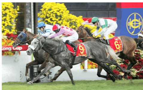
Precision (grey) takes Cup