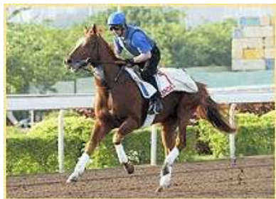
Grandera in Hong Kong

Godolphin yesterday confirmed that Grandera (Ire) (Grand Lodge) will head back to Dubai Tuesday where he will spend the winter before embarking on an international campaign at five. Having clinched the 2002 World Series courtesy of wins in the G1 Irish Champion