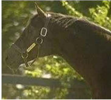
Conquistador Cielo