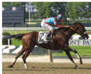
Sunday Break