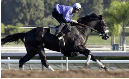
Gotham winner Mayakovsky