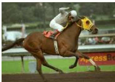
Got Koko upsets the La Brea

Got Koko (Signal Tap) charged down the center of the Santa Anita strip to upset favored You (You and I) and company in yesterday's GI La Brea S. The winner of the Torrey Pines S. on the Del Mar main track Sept.