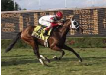
Nothing To Lose