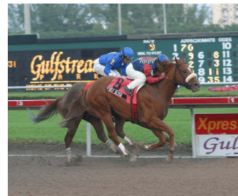
First Blush wins the Bid

recently third to Super Fuse (Lite the Fuse) in the Nov. 17 Huntington S. at the 'Big A.' Settled just behind the early pace, First Blush advanced steadily three wide into the stretch, collared front-running Crafty Guy (Crafty Prospector) at the eighth pole and outfinished that foe for the win. Second choice Silver Squire (Silver Ghost) ran on well from the back of the pack for third. Click here for the brisnet.com chart.