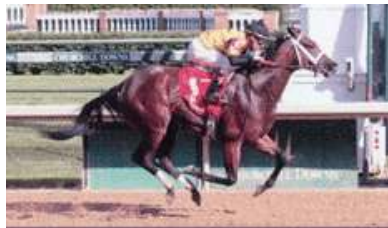
Sweet Nanette at Churchill

Demand on Wednesday proved strongest for broodmare prospects as the top five prices for mares were for young females ready to visit the breeding shed for the first time. A multiple stakes winner of $356,425, Sweet Nanette (You and I) topped yesterday's session of the Keeneland January Sale at $250,000. The newly turned five-year-old was consigned by Taylor Made Sales Agency; the ticket was signed by Rainbow Stable. Rainbow Stable is a group of partners that will be put together by Taylor Made.