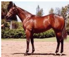
Lot 20