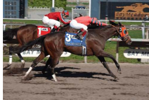
Tracemark