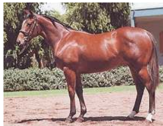
Lot 604

Australia's Thoroughbred industry demonstrated its resilience amid a climate of global economic uncertainty with another strong session of the Magic Millions Yearling Sale on the Gold Coast yesterday. The sale, which cracked the A$50-million mark in gross for the first time in its 17-year history, has achieved across-the-board gains through the first four sessions, showing a 13-percent increase for the aggregate and a six-percent rise in average. When Gerry Harvey and partners John Singleton and Rob Ferguson took over the ailing company in 1998, they realized a 30-percent increase in average and a 50-percent jump in gross on the first sale under their management, but the average five years ago was a modest