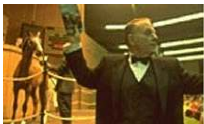
July Sale on hold for 2003

The Mare Reproductive Loss Syndrome, which hit Central Kentucky in early 2001 and has had a devastating effect on the yearling crop of 2003, is primarily responsible for the decision taken yesterday by officials at Keeneland to place its July Selected Yearling Sale on a one-year hiatus. Horses catalogued for July will instead be incorporated into the first two days--the "se-