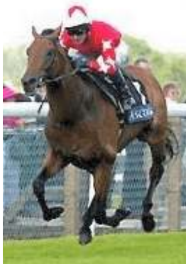
Rock of Gibraltar