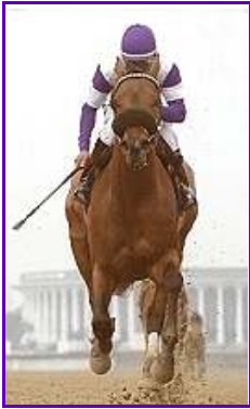
Elloluv