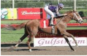
Lion Tamer