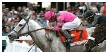
Best of the Rest

First or second in six of his last seven starts, veteran Best of the Rest (Skip Trial) proved he hasn't lost a step with a game win in the $1 million Ocala Breeders' Sales Co. Classic at Gulfstream Park yesterday. The gray was coming off a second-place finish in the Dec. 28 Gill Fred W. Hooper H. at Calder, where he stumbled at the