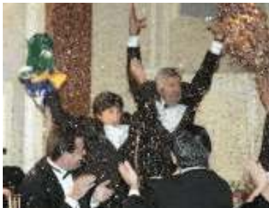
Connections of Farda Amiga celebrate their Eclipse victory