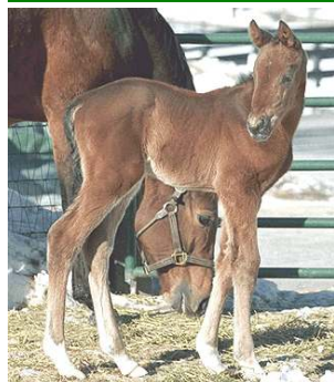
Second Foal by Point Given