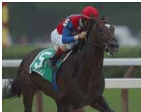
Medaglia d'Oro at Saratoga