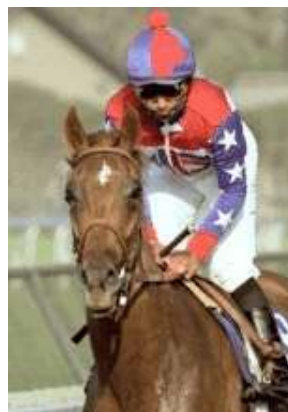
Horse of the Year Azeri