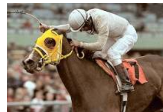
Got Koko