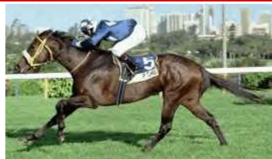
IPI TOMBE winning the South African Guineas