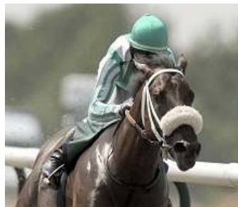
Elusive City