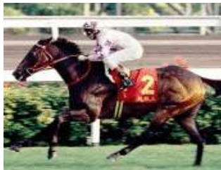
Fairy King Prawn