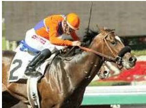
Atswhatimtalknbout