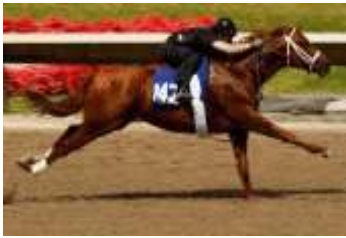
Hip 142