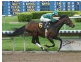
Mineshaft