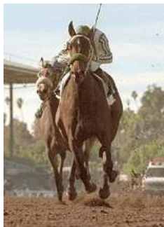
Atlantic Ocean

After enduring a downward trend that lasted five years, the Barretts March Sale turned it around in 2002, realizing an increase in the aggregate despite offering just 166 two-year-olds. The 2003 catalogue is 26 percent larger, with 209 lots entered, but can Barretts maintain the momentum without the presence of its biggest supporter? Prince Ahmed Salman, who passed