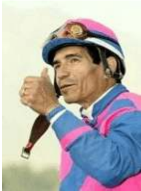
Laffit Pincay Jr.